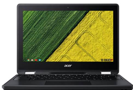
11" ACER Chromebook $506.10