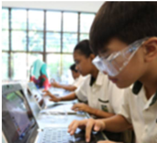
Support Self-Directed and Collaborative Learning