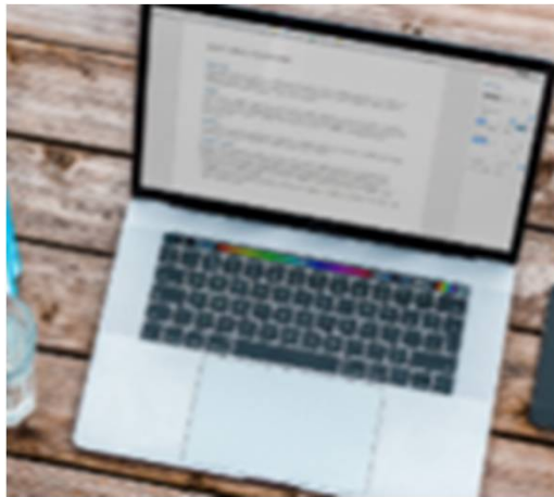
Support the Development of Digital Literacy

The use of the PLD for teaching and learning aims to: