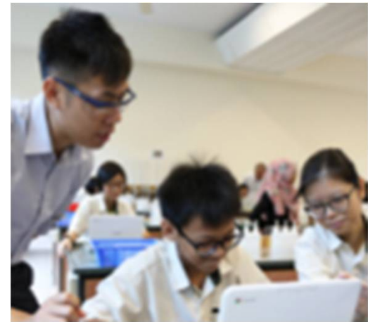
Enhance Teaching and Learning